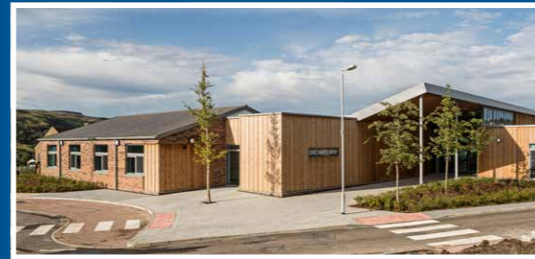
ORCHARD VIEW NHS Greater Glasgow and Clyde Value: £8.4M