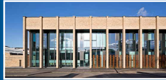
SHIELDS HEALTH AND CARE CENTRE NHS Greater Glasgow and Clyde Value: £2M