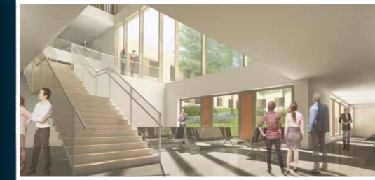
GREENOCK HEALTH AND CARE CENTRE NHS Greater Glasgow and Clyde Value: £20.8M