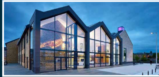
JOHNSTONE TOWN HALL Renfrewshire Council Value: £12.5M