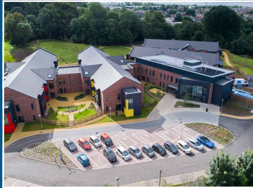
DUMBARTON CARE HOME West Dunbartonshire Council Value: £12.9M