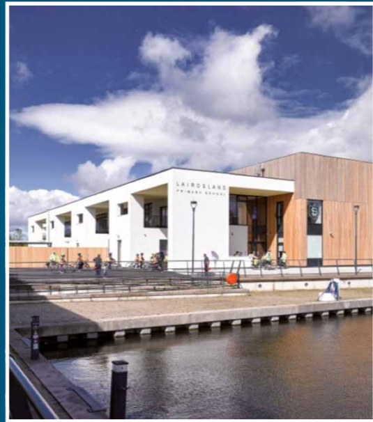
LAIRDSLAND PRIMARY SCHOOL East Dunbartonshire Council Value: £7.6M