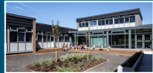
MOORFOOT PRIMARY SCHOOL Inverclyde Council Value: £5M