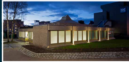
RENFREWSHIRE COMMUNITY SAFETY HUB Renfrewshire Council Value: £0.97M