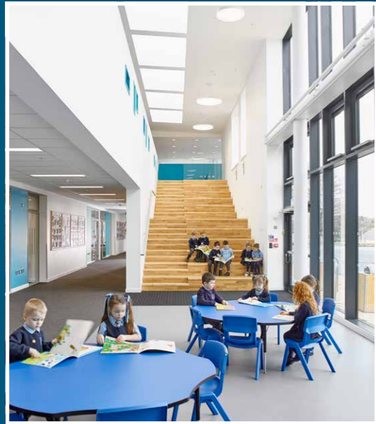
ST PATRICK'S PRIMARY SCHOOL Inverclyde Council Value: £6.9M