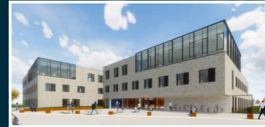
CLYDEBANK HEALTH AND CARE CENTRE NHS Greater Glasgow & Clyde and West Dunbartonshire Council Value: £19.3M