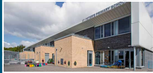
BELLSMYRE PRIMARY SCHOOL West Dunbartonshire Council Value: £9.6M