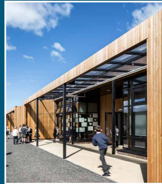
HOLY TRINITY PRIMARY SCHOOL East Dunbartonshire Council Value: £8.3M