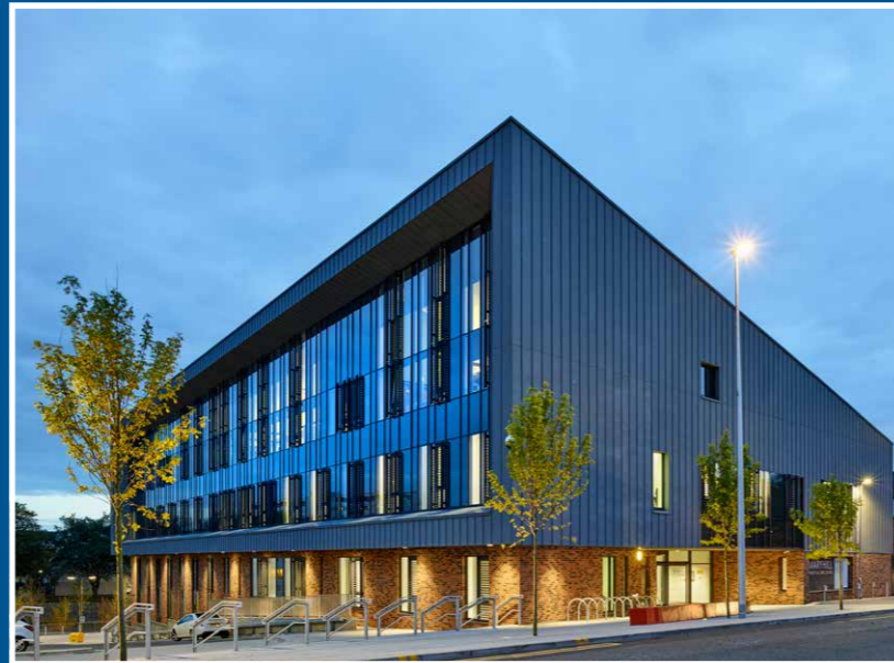
MARYHILL HEALTH AND CARE CENTRE NHS Greater Glasgow & Clyde and Glasgow City Council Value £12.4M