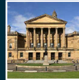
PAISLEY TOWN HALL Renfrewshire Council Value: £22M