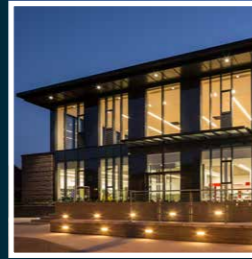
BEARSDEN COMMUNITY HUB East Dunbartonshire Council Value: £3.1M