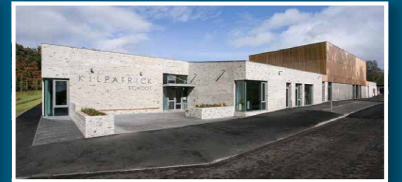
KILPATRICK ASN SCHOOL West Dunbartonshire Council Value: £10.2M