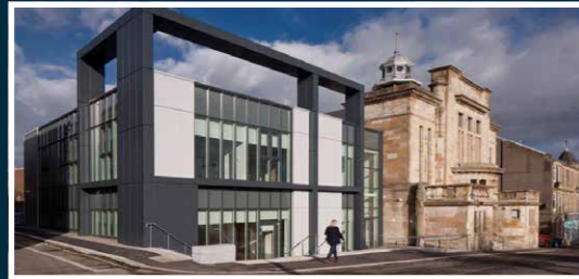
KIRKINTILLOCH TOWN HALL East Dunbartonshire Council Value: £5.3M