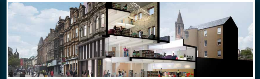
PAISLEY LEARNING AND CULTURAL HUB Renfrewshire Council Value: £6.7M