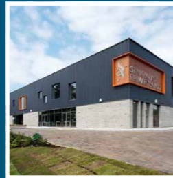
ST NICHOLAS' PRIMARY SCHOOL East Dunbartonshire Council Value: £10.3M