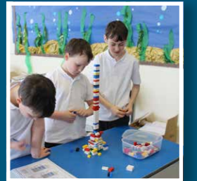
KILMACCOLM PRIMARY SCHOOL Inverclyde Council Value: £4.4M