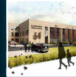
BLAIRDARDIE PRIMARY SCHOOL Glasgow City Council Value: £12.1M