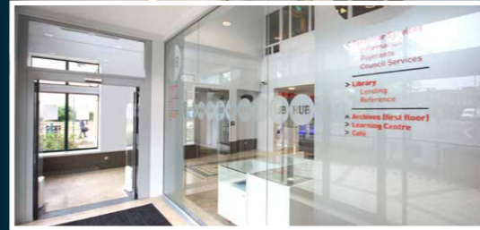
KIRKINTILLOCH COMMUNITY HUB East Dunbartonshire Council Value: £0.4M