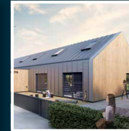
IC EARLY YEARS Inverclyde Council Value: £4M