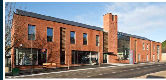
LENNOXTOWN COMMUNITY HUB East Dunbartonshire Council Value: £4M