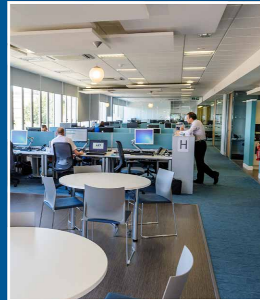
GARSHAKE OFFICE REFURBISHMENT West Dunbartonshire Council Value: £0.46M