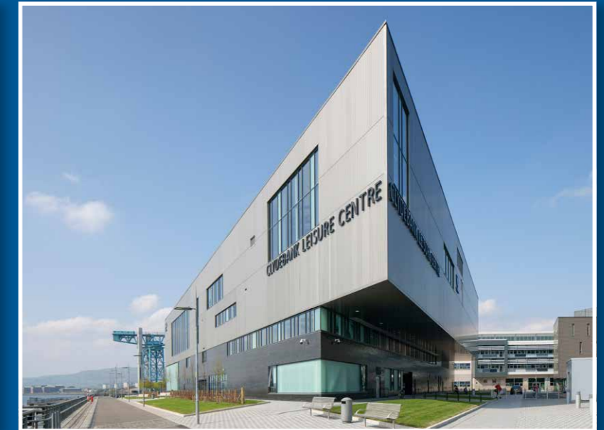
CLYDEBANK LEISURE CENTRE West Dunbartonshire Council Value: £23M