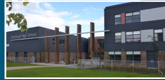
BARRHEAD HIGH SCHOOL East Renfrewshire Council Value: £28M