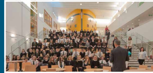
OUR LADY AND ST PATRICK'S HIGH SCHOOL West Dunbartonshire Council Value: £26.6M