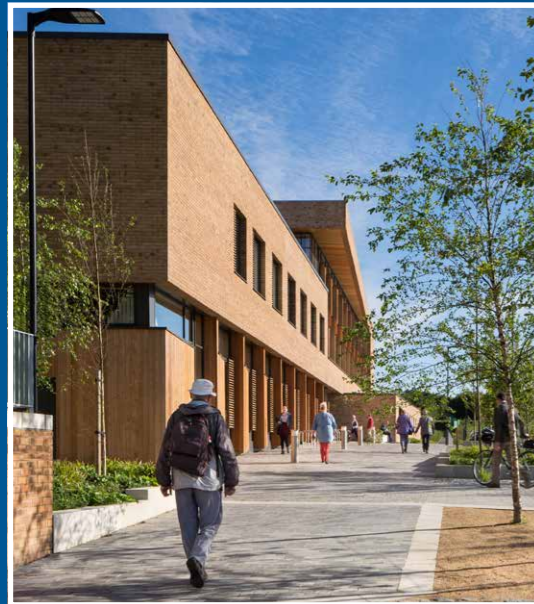
EASTWOOD HEALTH AND CARE CENTRE NHS Greater Glasgow & Clyde and East Renfrewshire Council Value: £14.9M