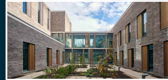
GORBALS HEALTH & CARE CENTRE NHS Greater Glasgow & Clyde and Glasgow City Council Value: £17.2M