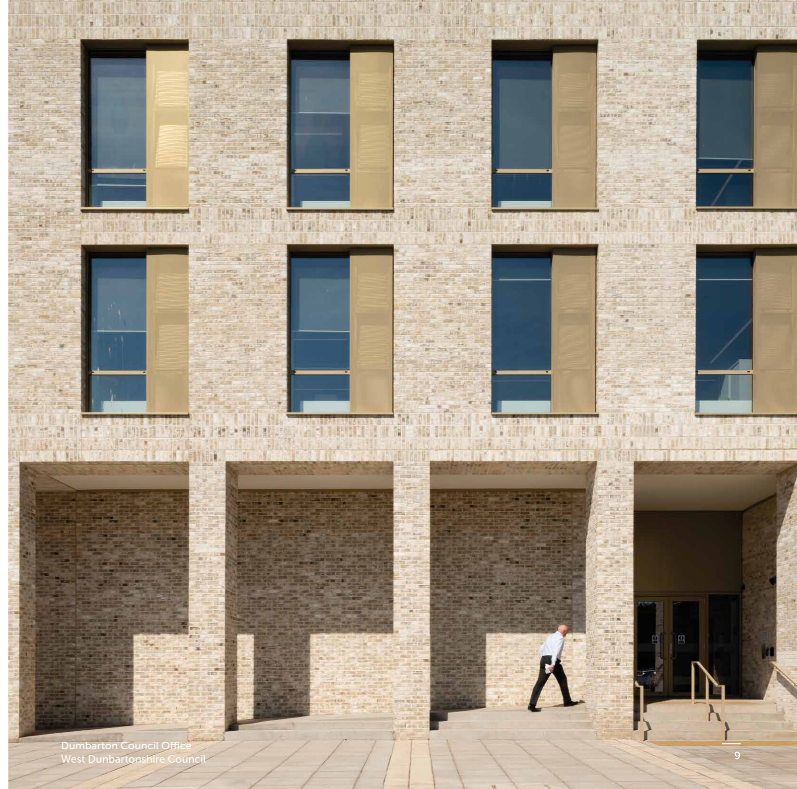
Dumbarton Council Office West Dunbartonshire Council