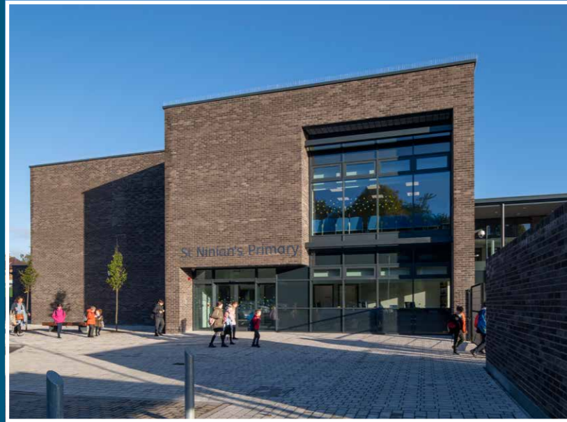
ST NINIAN'S PRIMARY SCHOOL Inverclyde Council Value: £8.9M