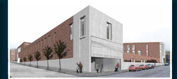
WOODSIDE HEALTH & CARE CENTRE NHS Greater Glasgow & Clyde and Glasgow City Council Value: £20.2M