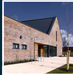
HILLHEAD COMMUNITY CENTRE East Dunbartonshire Council Value: £2.6M