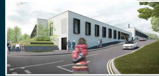
STOBHILL ACUTE MENTAL HEALTH WARDS NHS Greater Glasgow and Clyde Value: £10.6M