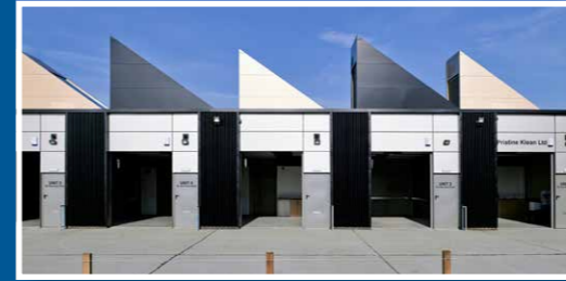
CLYDEBANK EAST WORKSHOPS Clydebank Re-Built Value: £1.5M