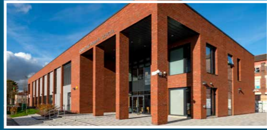
CARNTYNE PRIMARY SCHOOL Glasgow City Council Value: £7.5M