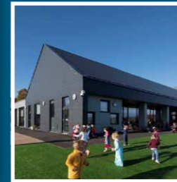
GLENPARK EARLY YEARS Inverclyde Council Value: £2.8M