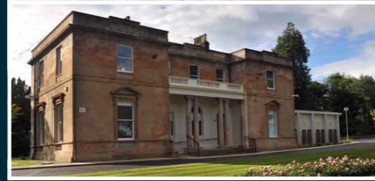
KILMARDINNY HOUSE East Dunbartonshire Council Value: £2.4M